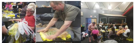
MAKING PLASTIC MATS!

We have a blast making mats and fellowshiping on Saturday mornings! New mats are started and old ones finished up. Hope to see you at the next one!